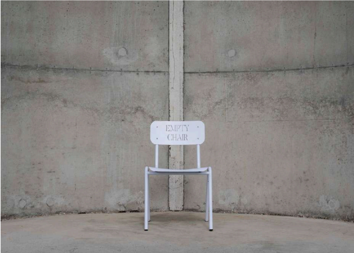
Empty Chair