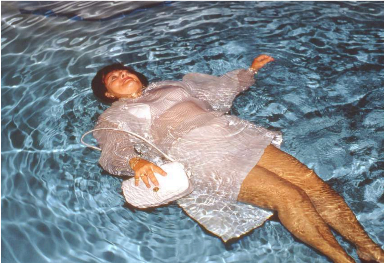
In almost every picture #11 © Erik Kessels