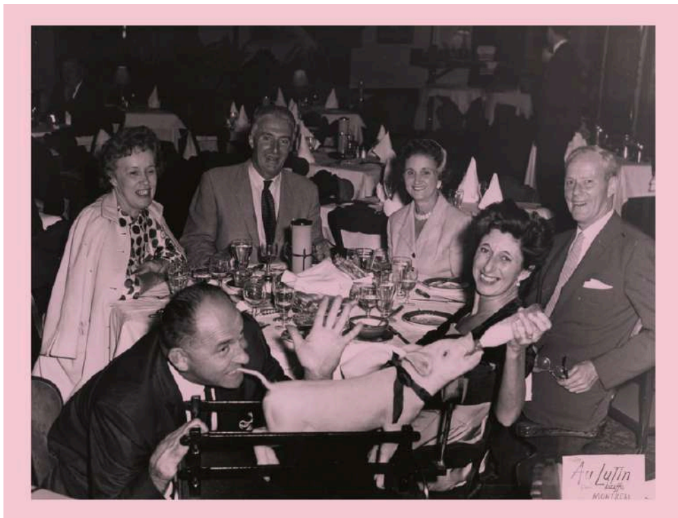
In almost every picture #10 © Erik Kessels